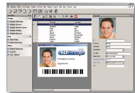
Image shows the IDPro7 batch selection feature

At Payne Security our experience with IDPro and the requirements of the commercial sector mean we understand what you need and will work with you to design, create and support an ID card system relevant for your business or organisation.