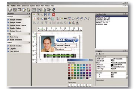
Image shows the IDPro7 card design feature

IDPro allows multiple card types to be produced from the one installation